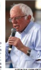
Sen. Bernie Sanders speaks at a campaign event Monday in Richmond, California. See SANDERS, 10A