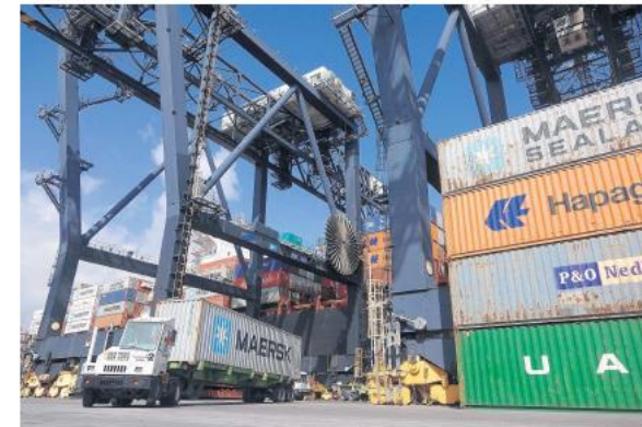
The Cardiff, an 889-foot-long container ship, is offloaded at Port Everglades of the Southport on Thursday.